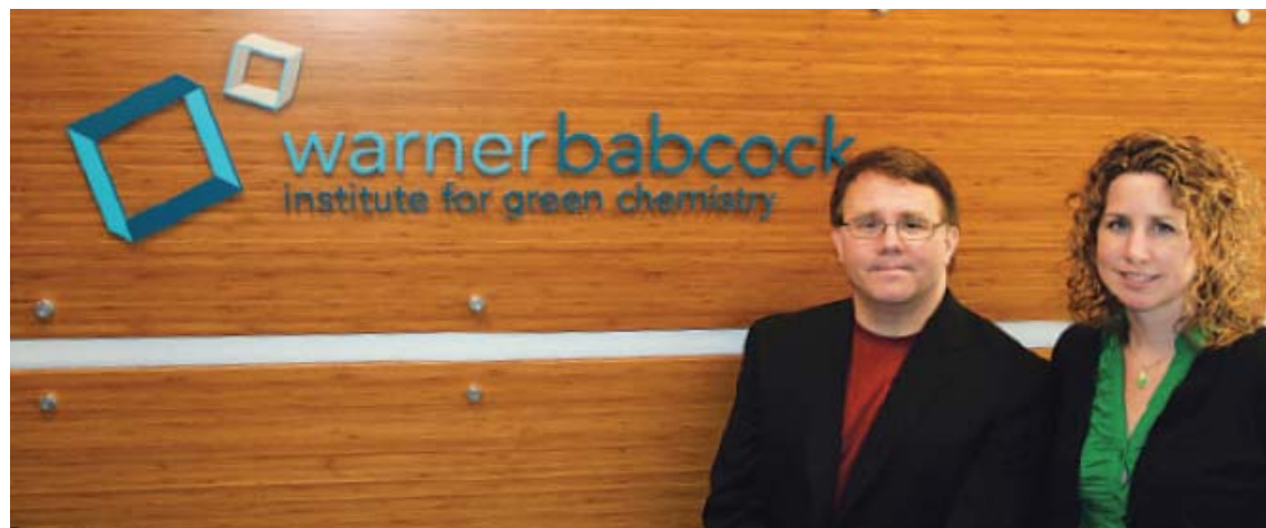
C&E News October 4, 2010