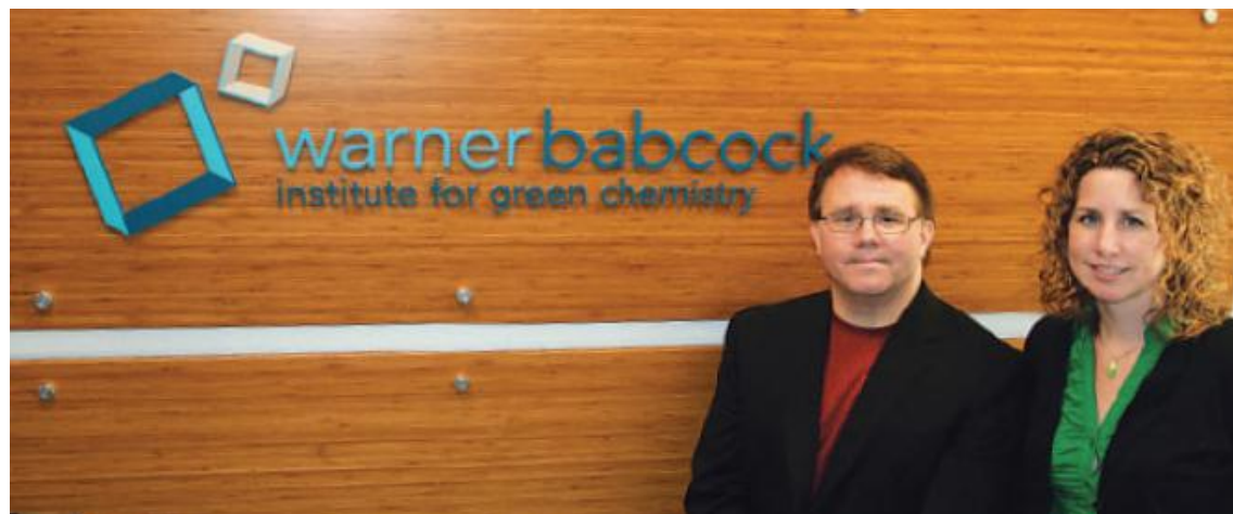
C&E News October 4, 2010